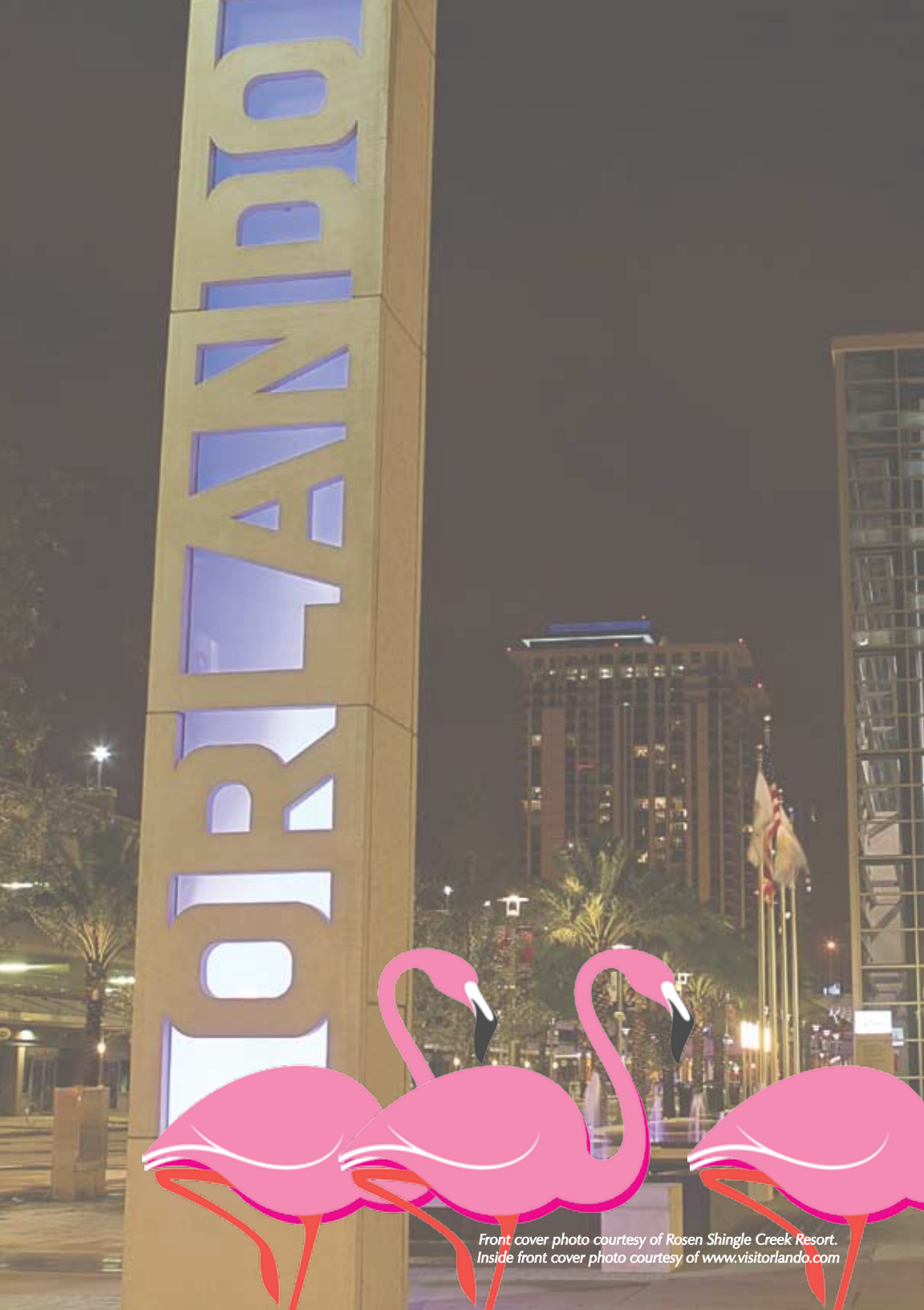
Front cover photo courtesy of Rosen Shingle Creek Resort. Inside front cover photo courtesy of www.visitorlando.com