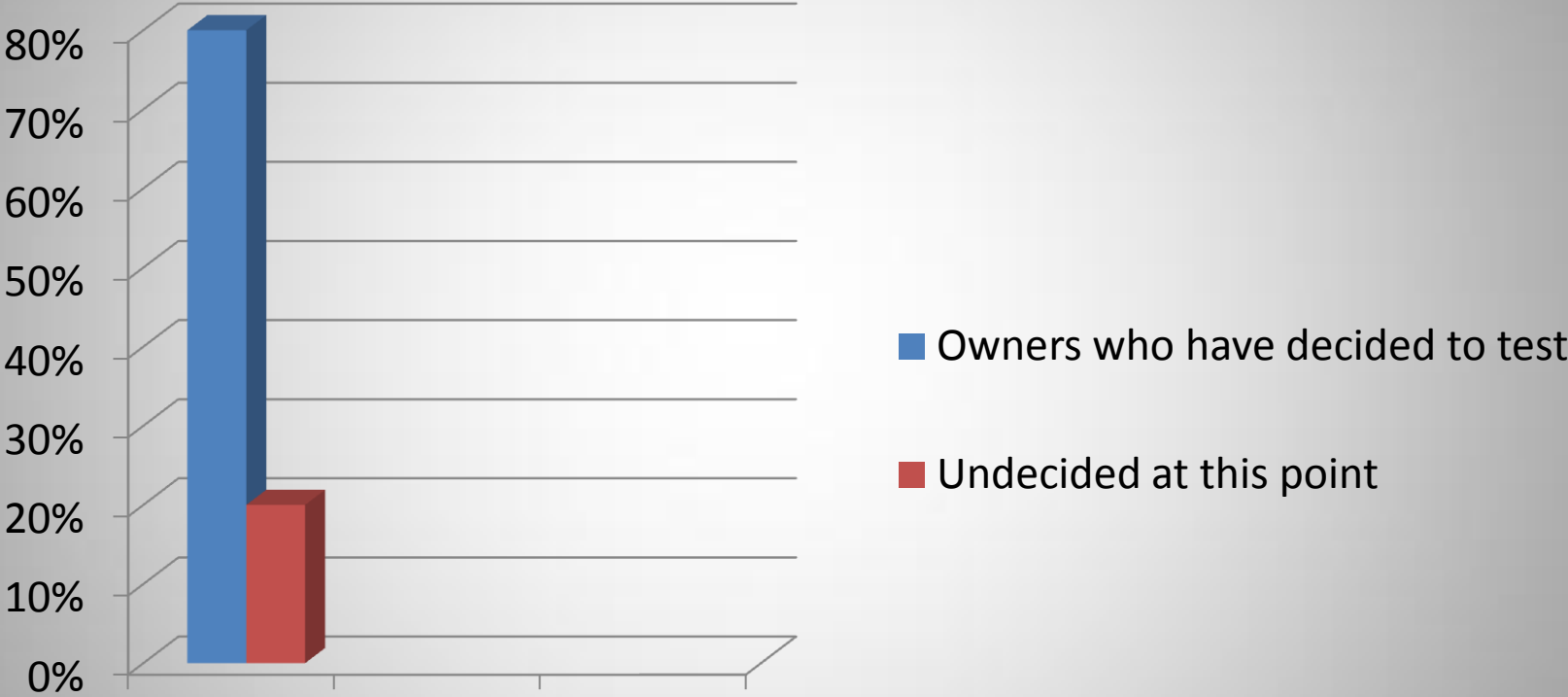
% of owners who chose to test vs. not test their properties for lead