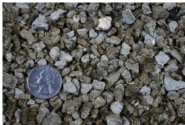
Typical vermiculite insulation

Look at the photos on this website and then look at the insulation without disturbing it. Vermiculite insulation is a pebble-like, pour-in product and is usually gray-brown or silver-gold in color.