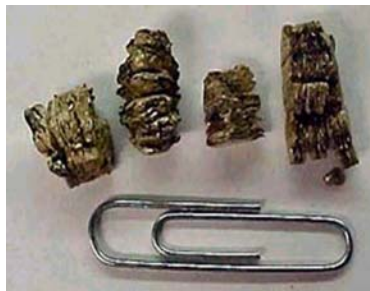
Vermiculite insulation particle size relative to paper clip