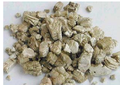
Typical vermiculite insulation