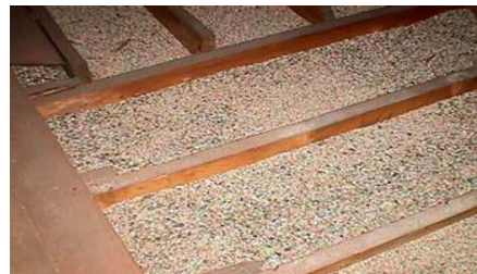
Vermiculite insulation between attic joists