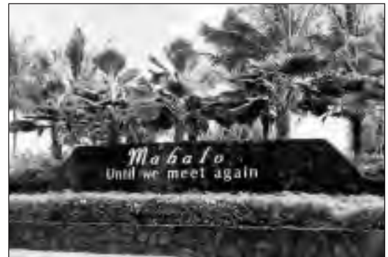
A picture is worth a 1,000 words.